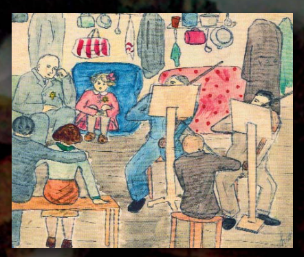
One of the many children's drawings from Terezín.