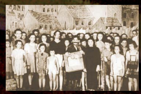
Cast of the children's opera 'Brundibár'